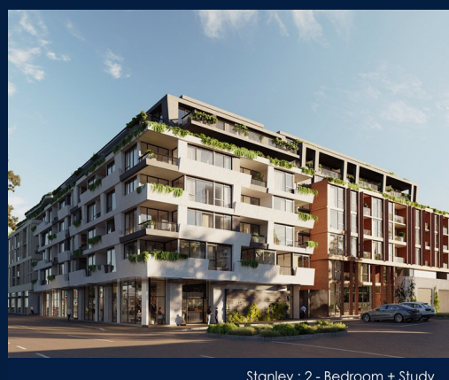
Stanley: 2 - Bedroom + Study