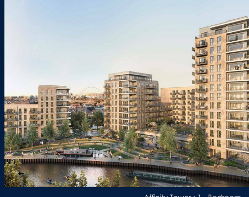
Affinity Tower: 1 - Bedroom