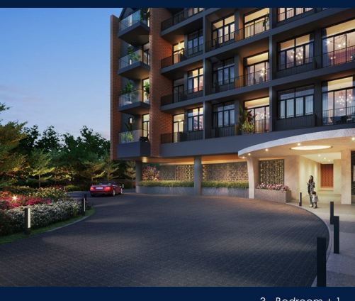
3 - Bedroom + 1