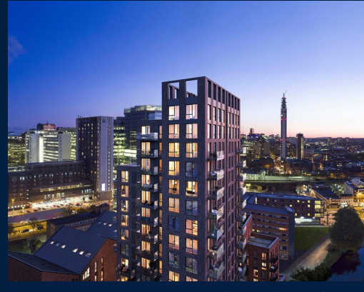
The Regent: 1 - Bedroom