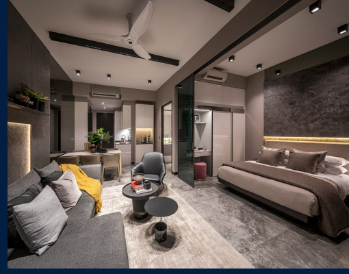
1 - Bedroom