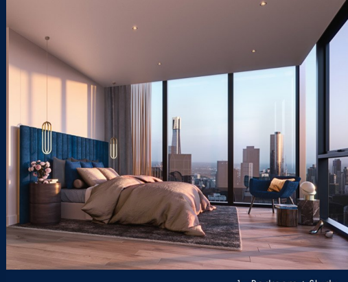
1 - Bedroom + Study