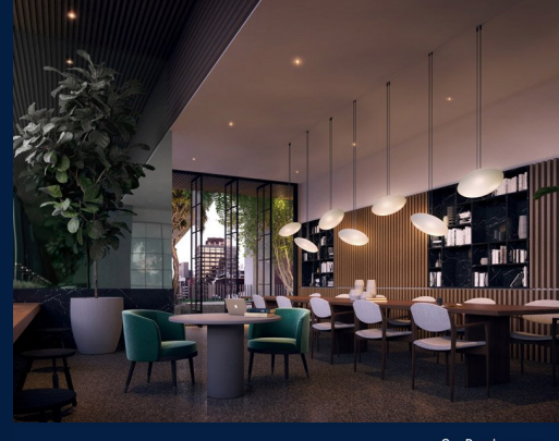
2 - Bedroom