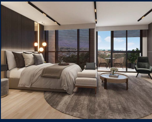
4 - Bedroom Penthouse