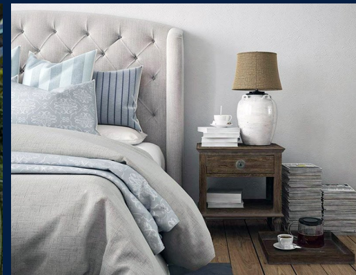
Studio + Study