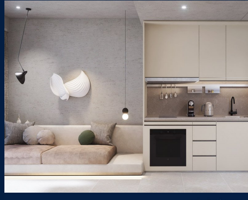
1+1 - Bedroom